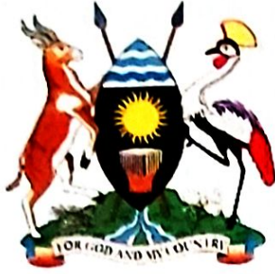
REPUBLIC OF UGANDA